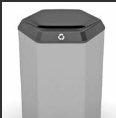
Slot top for recycling paper.