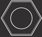
COMMINGLED RECYCLABLES + WASTE