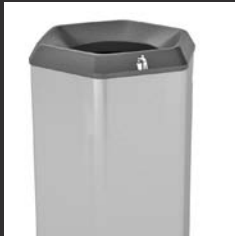
Hole top for recycling or waste.

HexBins sizes: 16 3/4"W, 19 3/4"W and 27 3/4"W x 32H & 42"H. All tops are one piece Roto-molded polyethylene, finished in Graphite with molded in decal.