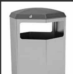
Rain top features side openings for use in interior and exterior applications.